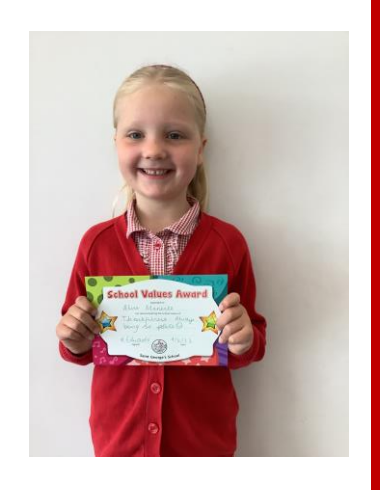
Aftice for showing thankfulness by always being so polite!