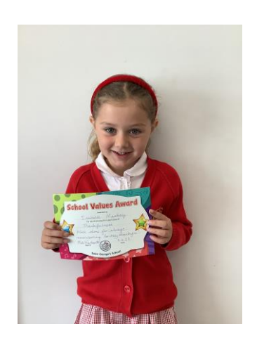
showing thankfulness by always remembering to say thank you!