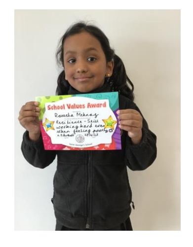
Racesha for showing resilience by still working hard even when feeling poorly!