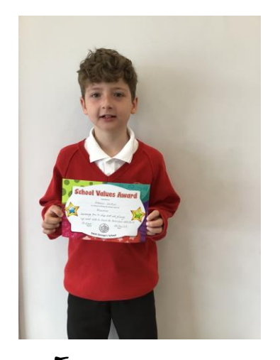
showing resilience by not giving up when learning how to skip!