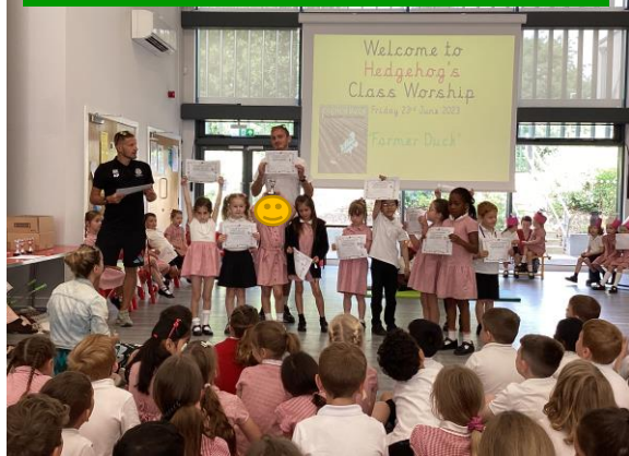
Year 3 Winners