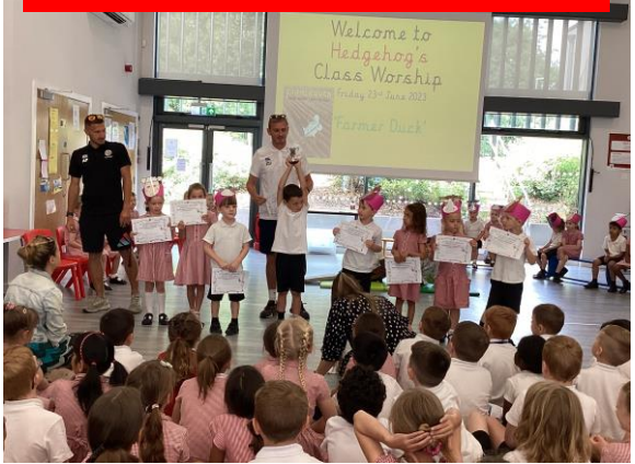
Year 2 Winners