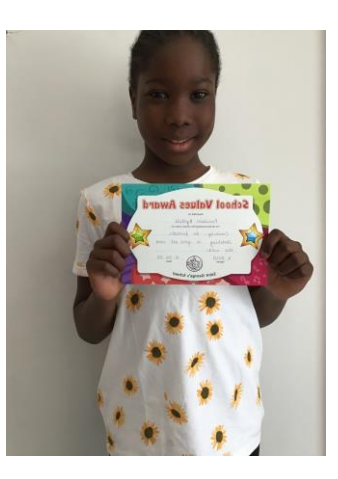
Pamilerin for showing creativity in her fantastic sketching!