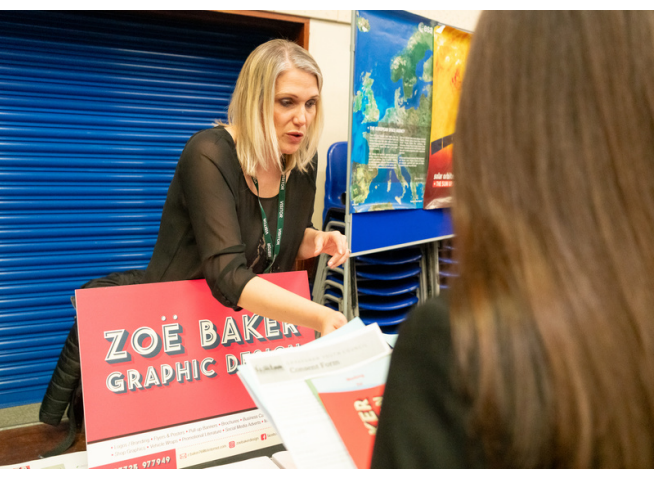
North Kent / Hadlow College