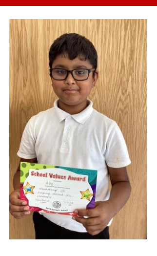
Apiq for showing stewardship by helping around the classroom!