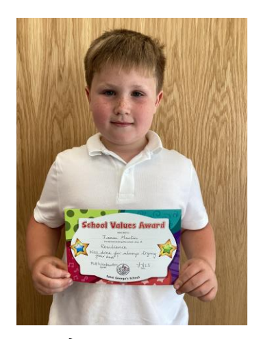
Naac for showing resilience by always trying his best!