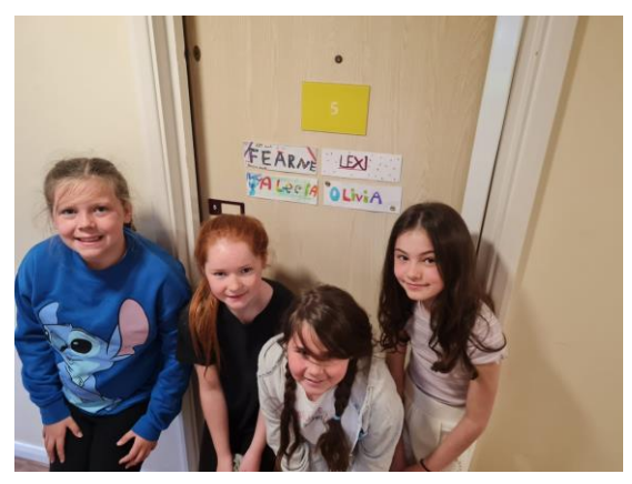
Fox Class this week!