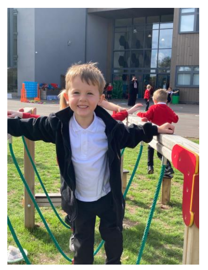
Trim Trail Fun