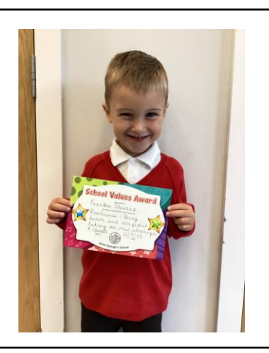
Frankie for showing resilience by being brave & taking on new challenges!