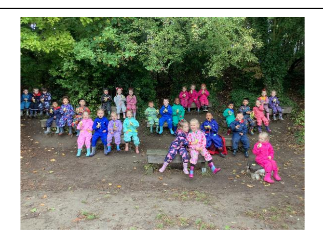
The Whole of Ladybird Class for showing resilience and behaving so beautifully in front of our special visitors!