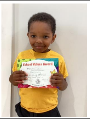
Maximus for showing creativity in his amazing portrait!