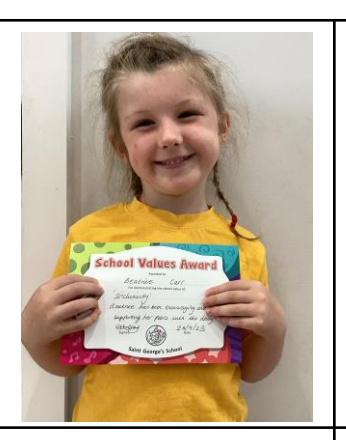
Beatrice for showing inclusivity by supporting her peers!!