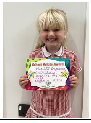
Matida for showing stewardship in her amazing tidying up!