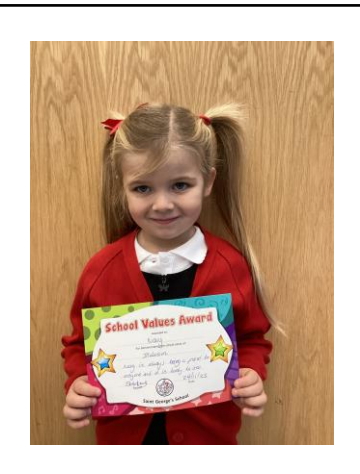
Navy for showing inclusion by always being such a good friend!