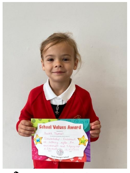
Aurora for showing excellent stewardship when tidying up!