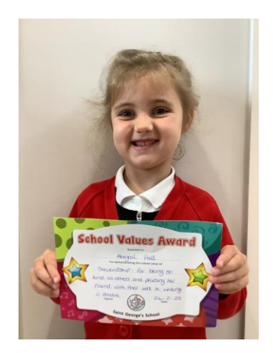
Abigail for showing stewardship by being kind & praising others!