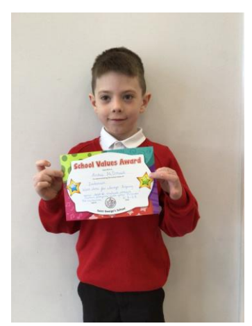
Archie for showing inclusion by always trying to include all his friends!