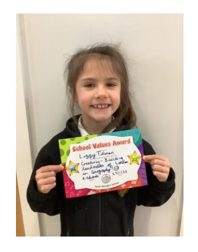
showing creativity when building landmarks of london!