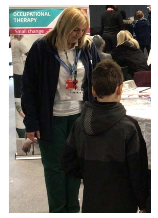
Kent County Council Occupational Therapy