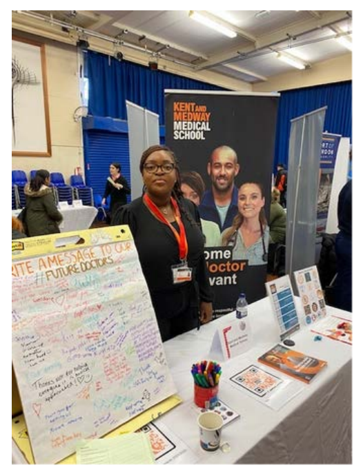
Kent & Medway Medical School