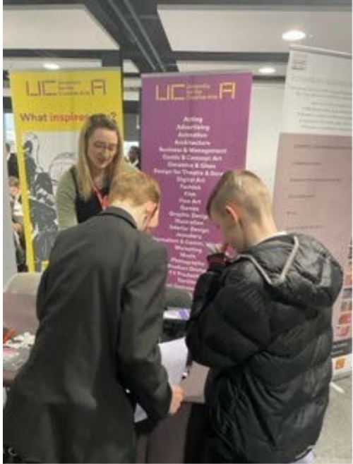
University for the Creative Arts